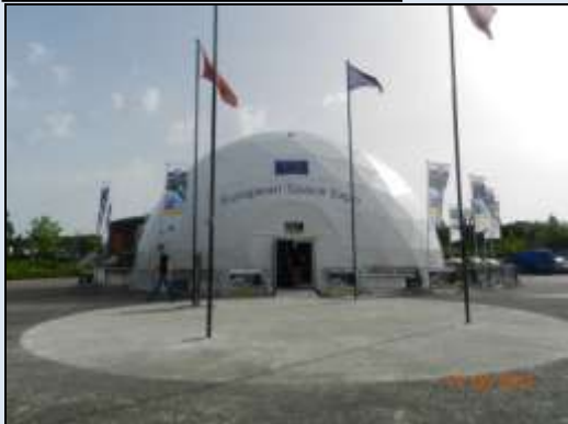
European Space Expo at Toulouse Cité de l'Espece