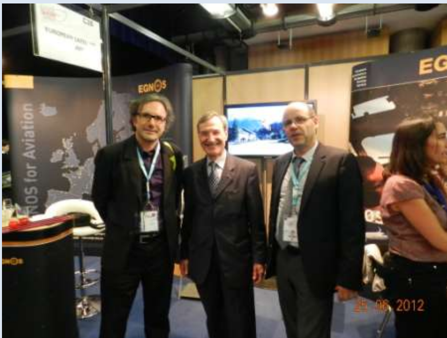
French CNES President Yannick d'Escatha (in the middle) visiting the ESSP booth at the Toulouse Space Show 2012

The Toulouse Space Show was completed with the debut of the “European Space Expo”, an initiative from the European GNSS Agency (GSA) oriented to the general public and which final aim is to familiarize the European citizens with the EC Space policy. The Expo will showcase the flagship programmes of Galileo, EGNOS and GMES, which are expected to create global market opportunities and help to support job creation and economic growth.