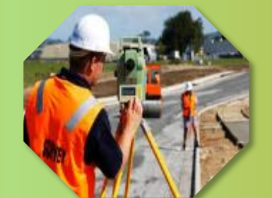
EGNOS in all mapping devices