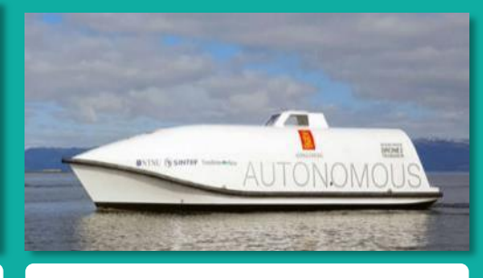
Maritime Autonomous Surface Ships