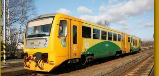
EGNSS for Rail signalling