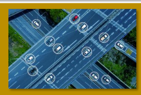
Connected and autonomous cars