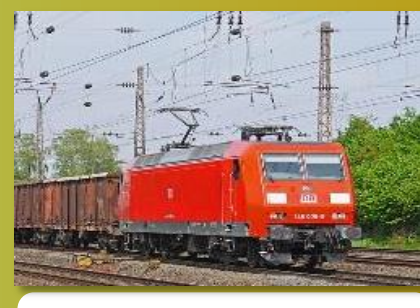
> 150 000 wagons with EGNSS for non-safety critical apps