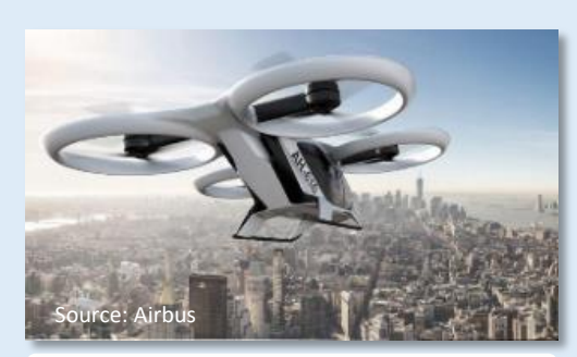
Urban air mobility