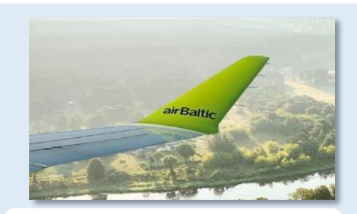
798 EGNOS approaches EGNOS avionics for 38% of EU fleet